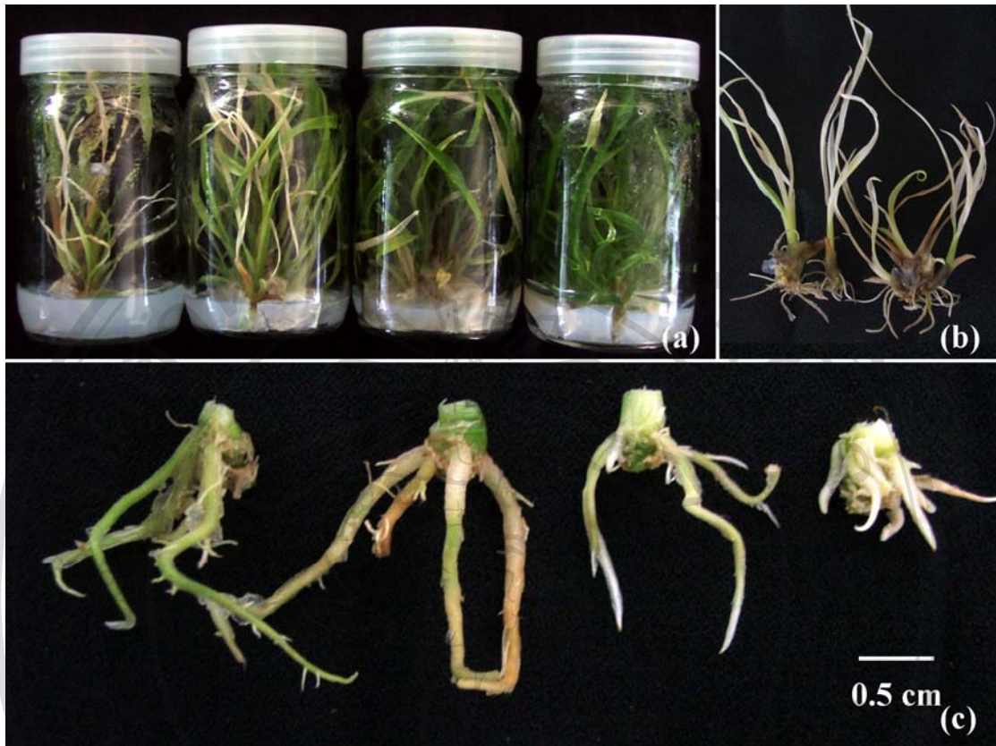
Figure 4.2 Culture of C. alismatifolia Gagnep in In vitro . (a) Shoot multiplication on MS medium containing 6, 5, 4 and 3% sucrose concentration (induction period: 6 months). (b) Browning of plantlets grew on MS medium containing 6% sucrose concentration (growing period: 6 months). (c) New rhizome and contractile roots cultured on MS medium containing different sucrose concentrations [3, 4, 5 and 6%] (induction period: 8 months).

ลิขสิทธิ์มหาวิทยาลัยเชียงใหม่ Copyright© by Chiang Mai University All rights reserved