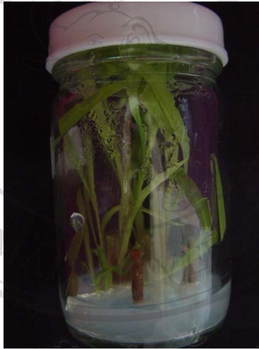
Figure 4.1 The young shoots of C. alismatifolia were cultured on MS medium with free plant growth regulator.

Twenty shoots (1 shoot/culture) were used as replication in each treatment. The number of shoots and rhizomes per explant, diameter of rhizome, number of contractile roots per rhizome, length of contractile roots, and fresh weight of rhizome were recorded after 8 weeks. Data were subjected to analysis of variance to test the individual effect of sucrose.