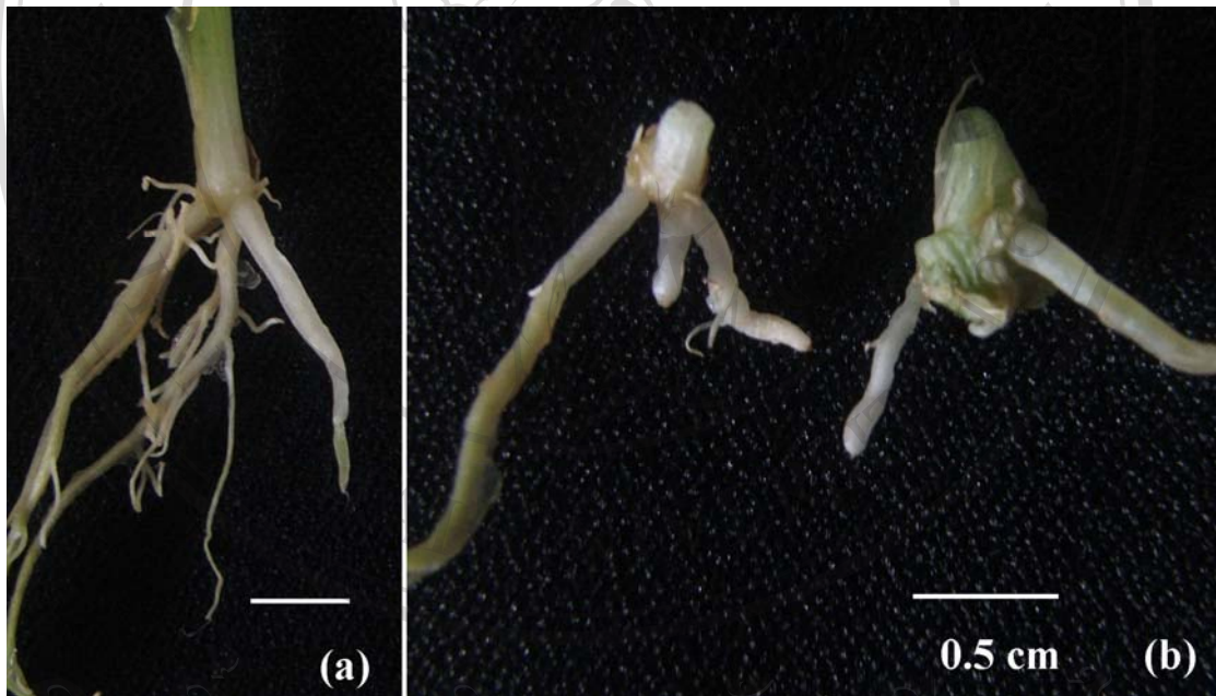
Figure 4.3 Contractile roots of C. alismatifolia Gagnep cultured on MS medium containing 4% sucrose [(a) at 6 months and (b) 8 months].

1/ Mean within the same column followed by different letter were significantly different at P<0.05